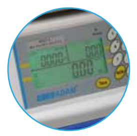
Backlit LCD Displays