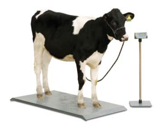
PS2000 shown with optional indicator stand

Easy Assembly – No installation costs or parts that require maintenance. Just place the scale on a hard surface and level by adjusting the foot pads. Connect the indicator and turn on the power.