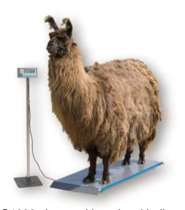
PS1000 shown with optional indicator stand