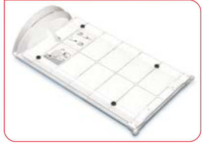
The high-quality folding mechanism guarantees a long service life.